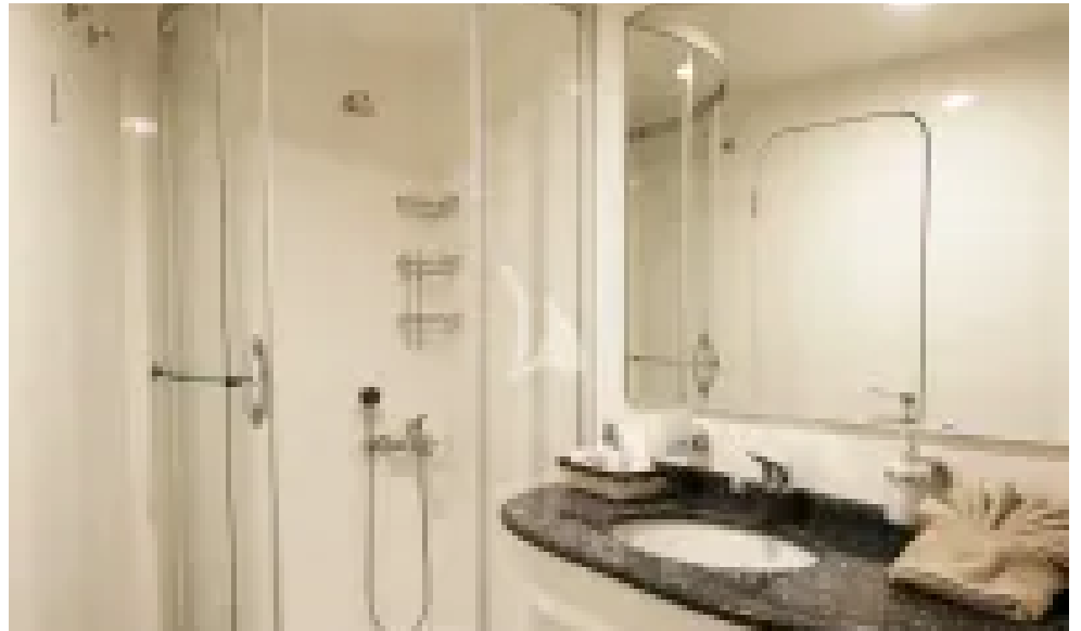
Mater suite - Bath