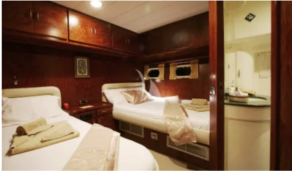
Twin Suite - 1