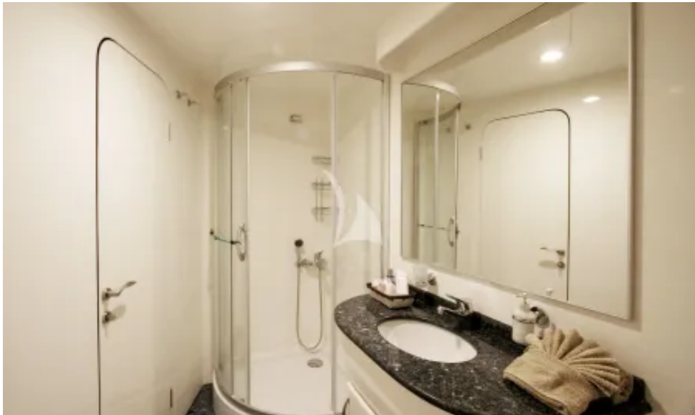
Mater suite - Bath